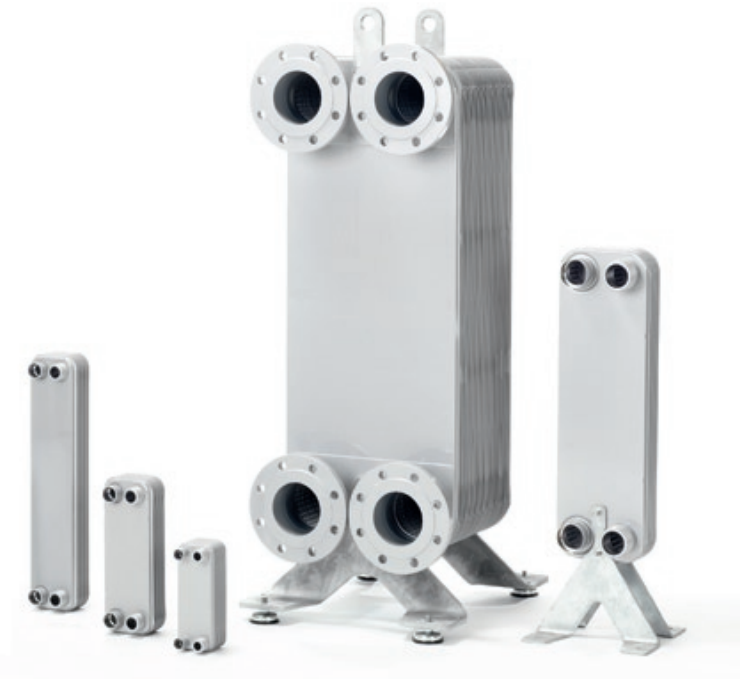
Alfa Laval endeavours to perform its own operations as cleanly and efficiently as possible, and to take environmental aspects into consideration when developing, designing, manufacturing, servicing and marketing its products.

Transportation accounts for a large part of Alfa Laval's \mathrm{CO}_2 emissions. In order to reduce these emissions, all transportation providers are evaluated and classified from an environmental point of view. Furthermore, strict demands are placed on transportation providers to propose ideas for reducing the environmental impact of Alfa Laval's transportation.